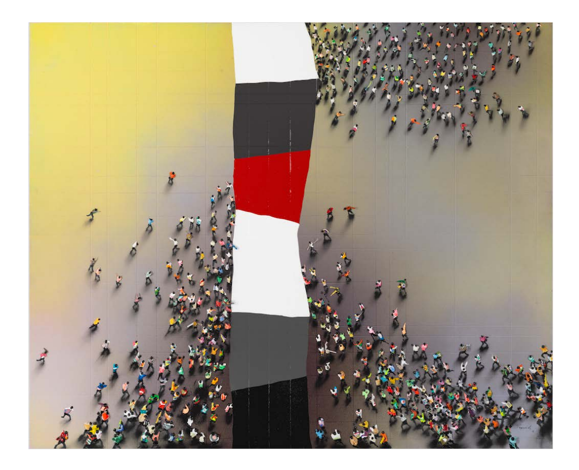
Desplegable , 2018 , 130 x 160 cm

There are two important subjects that feature in this series: the 'individual', which he depicted through collage, and the 'crowd', which he painted in a cinematographic style. These depictions, often captured from an aerial view, are often taken out of locational and situational context, as if granting the viewer the power of omnipotence over swarms of anonymous multitudes. Suspended in time and in space, these figures are devoid of direction and of narrative, but they seem to be held together by a common sense of communality. A metaphor of the horrors of dictatorship perhaps, or sanguine messages of unity and camaraderie? Nonetheless, Genovés' works embodied more than just political ideas, they represented the realities and apprehensions of a world made kinetic, compelling and frenetic with its people and their movements.